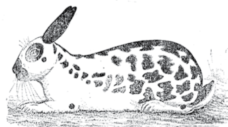
The Club's Initial Standard Ideal, 1908

The standard calls for twelve different elements to be in place, each outlined in detail as to what should be expected and an illustrated ideal for everyone to see what the rabbit should look like. There does not appear to be any set